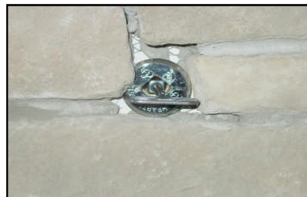
Gas valve key ↗