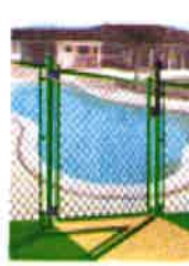
CHAINLINK GATE “Top Pull” model

Magnetic triggering means no resistance to closure!