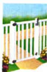
VINYL GATE “Vertical Pull” model