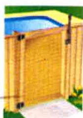
WOOD GATE “Top Pull” model