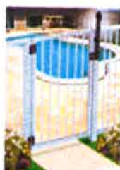
METAL GATE “Top Pull” model